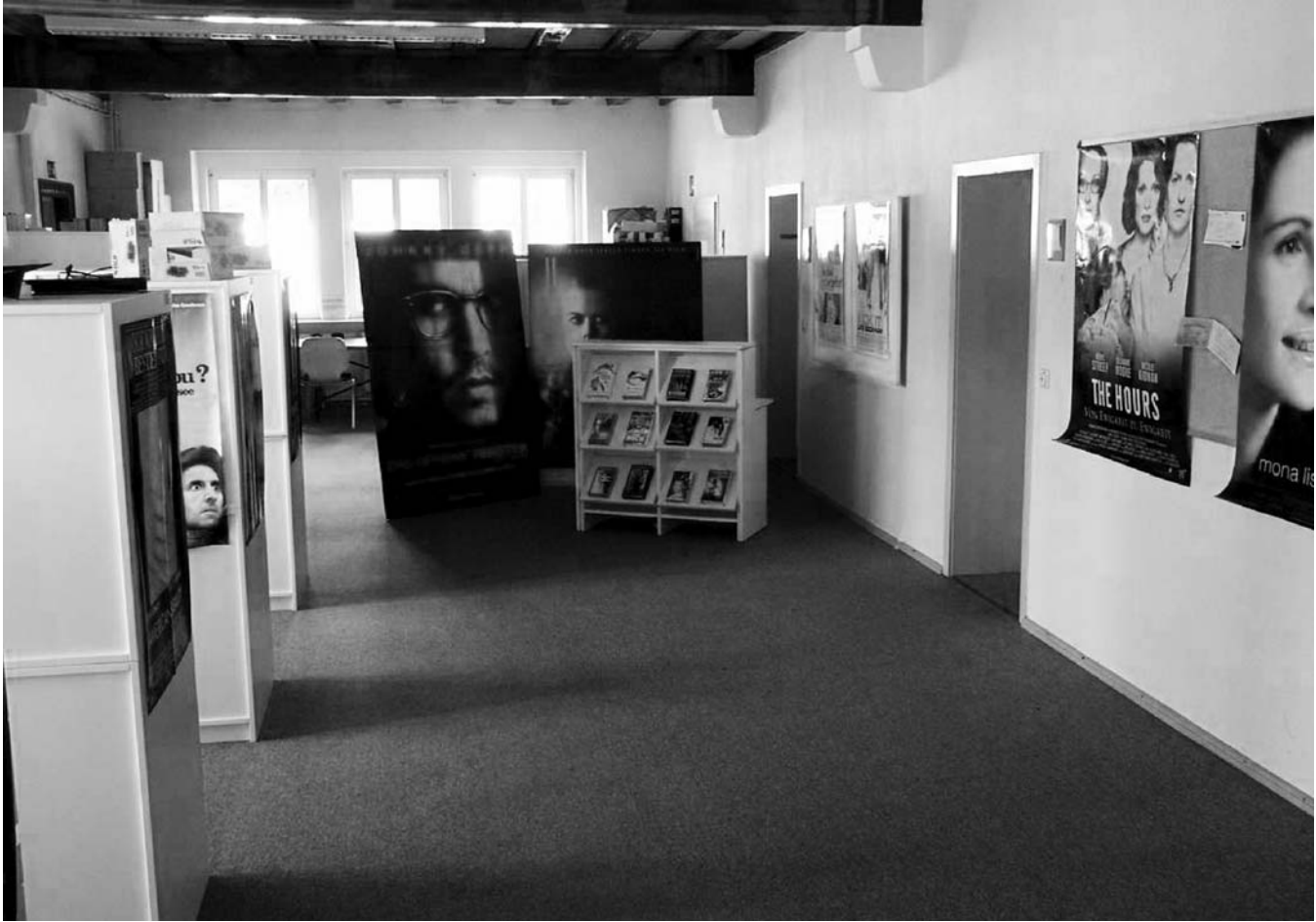
FIGURE 2 Design of the Video Consulting Store

Finally, we developed a standardized service script that consisted of a list of questions about customers' movie-related preferences to ensure that all service encounters would be identical in nature in all respects other than the experimental manipulations (for further details about the service script, see Appendix A). Data collection took place over a period of seven days. Each actor played only one role per day over a time of approximately two-and-a-half hours. We randomly determined the roles in advance, and each actor performed for roughly equal amounts of time in each of the four roles.